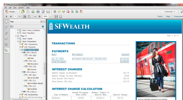
The tag structure of a properly tagged table with a defined header row